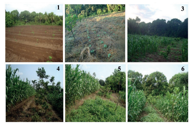
rambutan and corn; 2) rambutan and corn with managed weeds; rambutan and corn with weeds; 4) establishment of rambutan plants; rambutan and beans and with managed weeds 6) rambutan and corn, beans and pumpkin

The recorded data were transformed to energy values according to conversion tables (10). Finally, with the information obtained, an economic analysis was carried out (11).