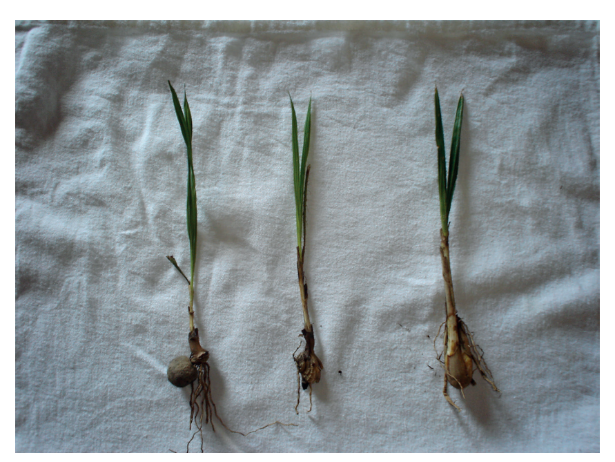
Figure 4. Plants naturally germinated extracted from the soil for transplant

The species A. aculeata in Brazil can be found preferentially in valleys and around cloud forests, semidesiduos (tropical forests sub deciduous) and its spread is facilitated by