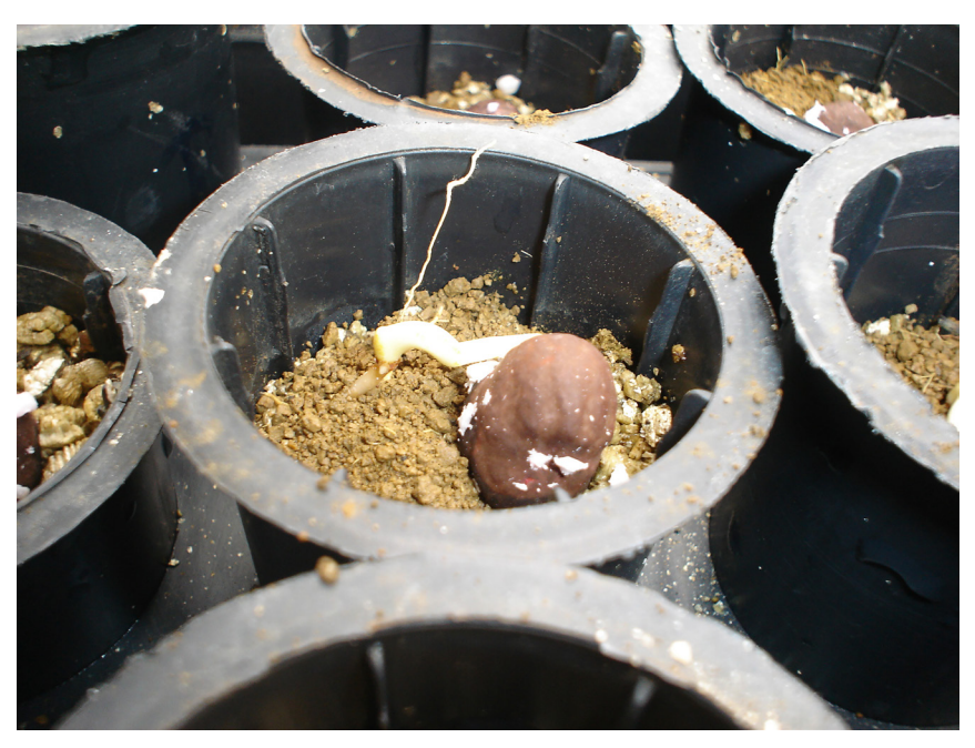
Figure 9. Seeds pregerminated, planted in plastic tubes