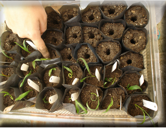
Figures 6 and 7. Transplanting of vitroplants to bags for their acclimatization in plastic boxes with lid, used as wet chamber