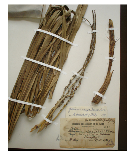
Figure 15. A. crispa, now Gastrococos crispa