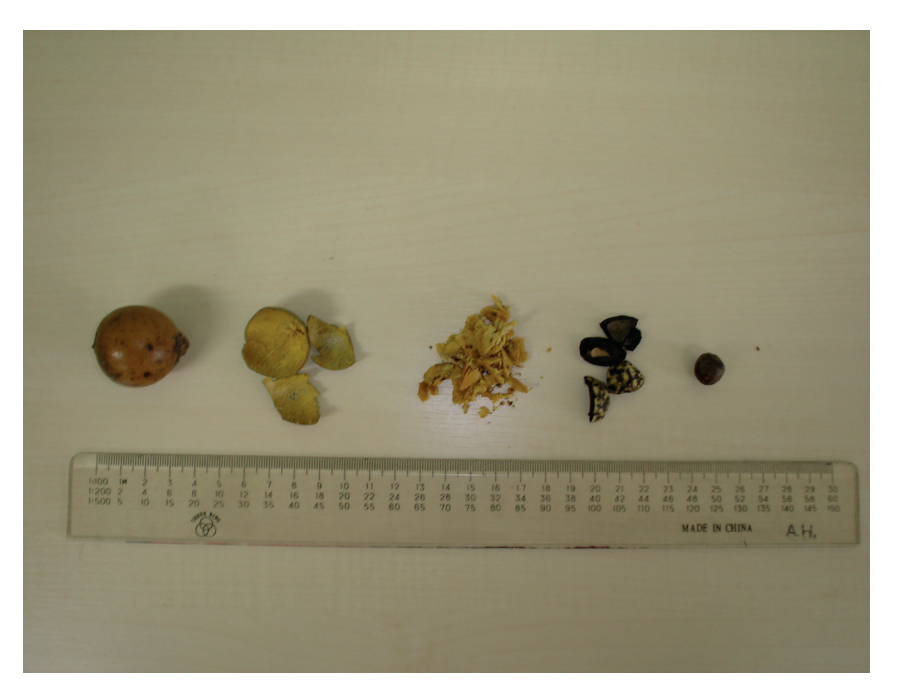
Figure 3. Fruit of A. aculeata , showing the different parts of what is composed

The total oil ranges between 16 and 23 % of fresh fruit weight, and between 25 and 34 % dry weight, with about one-sixth from the nugget. The dry matter of the pulp has a 3, 4 % protein, and often there is a small amount of sugar and carotene. Consequently, the results as a good source of calories are considered and some varieties can provide reasonable amounts of vitamin<sup>A</sup> (9).