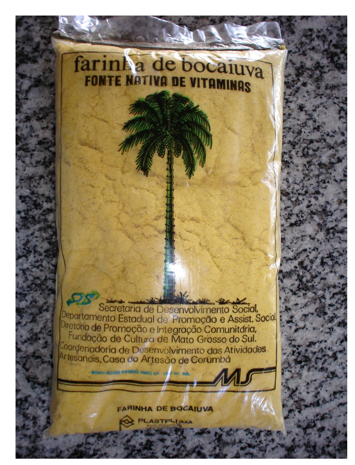
Figure 10. A. aculeata flour produced from the mesocarp of the fruit