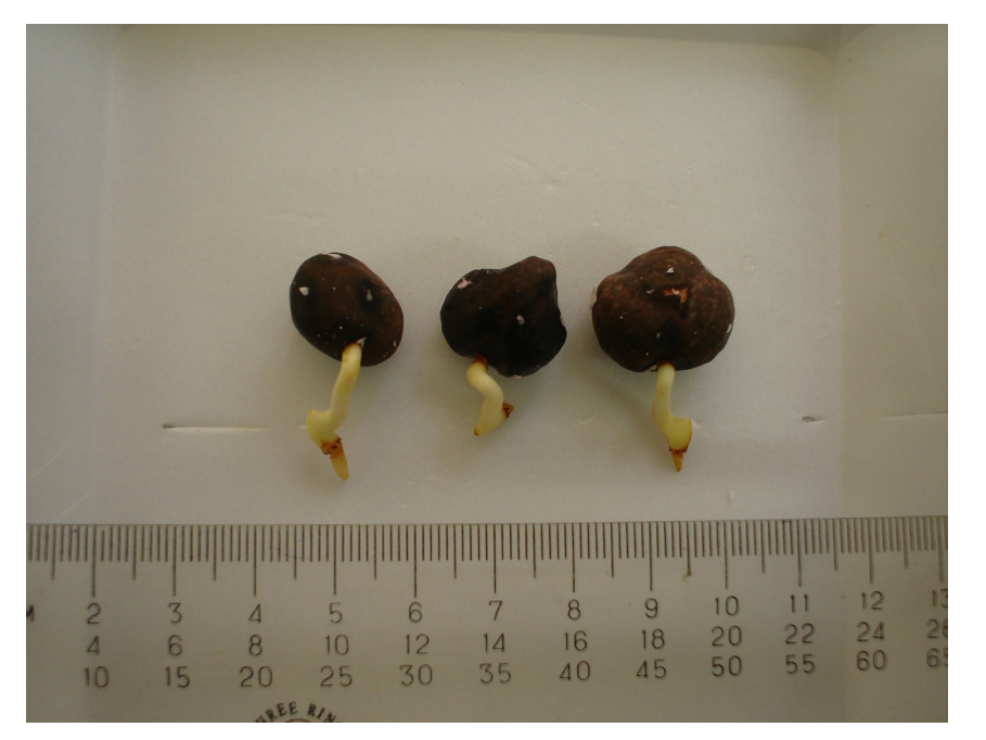
Figure 8. Pregerminated A. aculeata seeds