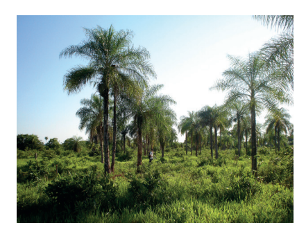
Figure 1. A aculeata., Field of natural managed sprout in Mato Grosso do Sul, Brazil

It should be noted that the word "aculeata" that identifies this species, refers to hard spines, rigid and stingers (14). Some researchers have agreed that the characteristics of Acrocomia aculeata are as follows; it is a single palm trunk, medium, thorny and monoecious (Figures 1 and 2), erect up to 15-20 m tall trunk, often less and 30-50 cm in diameter, very abundant in leaf scars and densely armed with thorns. The root system with frequency much is greater than the cup diameter.