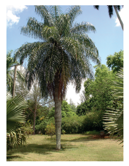
Figure 2. A. aculeata. National Botanical Garden., Havana, Cuba

The reduplicatedly pinnate leaves, ones about 20-40 in the cup of gray-green color. They are of 3-5 m long and more or less curved. The pod is about 40 cm in length, with brown hair and armed with black thorns. Petiole up to 60 cm long and armed with black thorns, prickly also rachis; the leaflets, in number of about 100-120 on each side of the spine, about 30-70 cm long and 3-5 cm wide, and arranged in several unarmed pianos, which gives the leaf a feathery and the interfoliar inflorescence up to about 150 cm long, peduncle about 60 cm long and densely