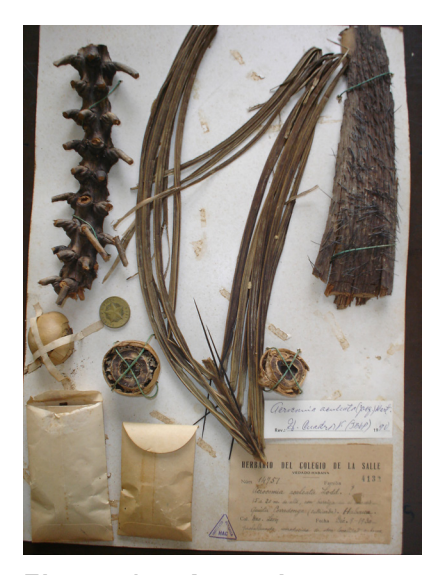
Figure 14. A. aculeata , now A. aculeata