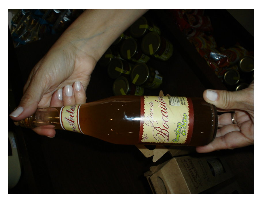
Figure 11. Liquor made from adult plants of A. aculeata

Currently, programs aimed at improving the current collection and extraction techniques ongoing several researches. This is to better exploit the pulp oil, equivalent to about six times the kernel oil; but apart from the problems of collecting mature fruits and avoid rapid deterioration, the task of separating the pulp from the exocarp and endocarp, and oil and fiber mucilage, it is difficult when the pulp is not dry. Techniques that are currently under review as, rapid bleaching, pulping machines using specially designed for the purpose, the enzymatic decomposition of mucilage and extraction with solvents have been suggested (24).