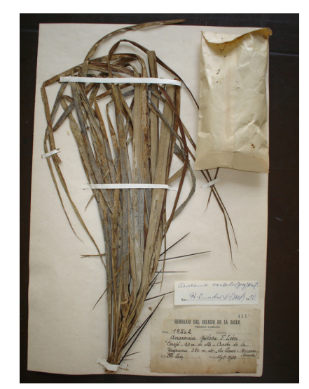
Figure 13. A. pilosa , now A. aculeata

The corojo, with scientific name Acrocomia armentalis (Morales) Bailey, is ranked in Guisa, Granma province, Cuba, as an ornamental plant and fodder (49).