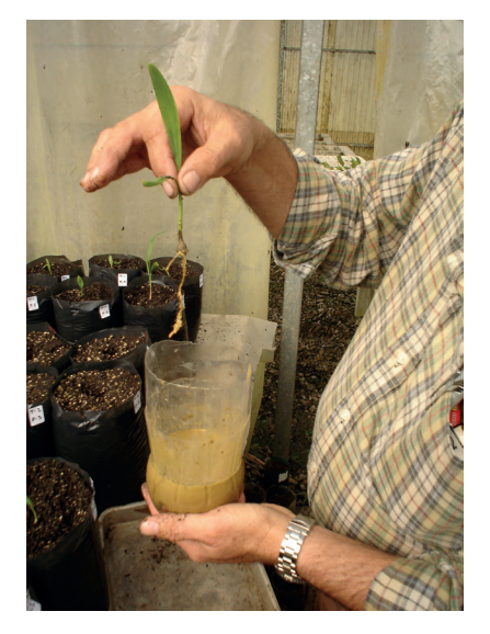
Figure 5. Transplant of adapted vitro plants to bags to a substrate

of both the aerial part and the underground part and leaf area (35) (Figures 5, 6 and 7).