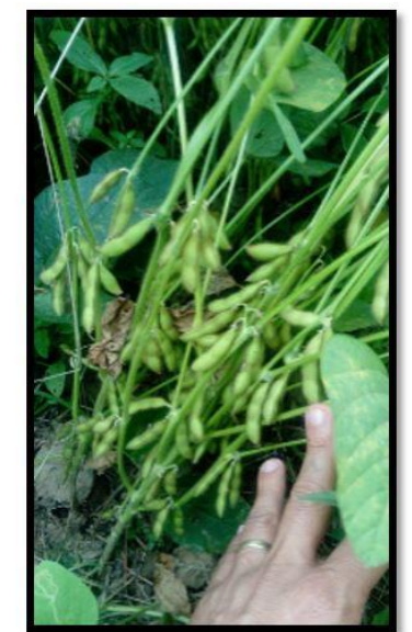
Plants in the flowering stage