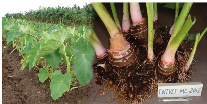
Photo 1. 'INIVIT MC-2012'

Due to the new genotype qualities, its response in the field and acceptance by the producers, explants were produced in the INIVIT Plant Biotechnology laboratory for the transfer of the micropropagation methodology to the National Network of Biofactories. It belongs to the Production Company and Seed Marketer of the Ministry of Agriculture in Cuba, with the aim of producing planting material of high genetic and phytosanitary quality. In addition, with the introduction of this cultivar in the productive sphere, the clonal diversification of the Colocasia genus was favored, the yield potential of the culture was increased and it was shown that with the application of tissue culture techniques the time to obtain a new cultivar, (Photo 1).