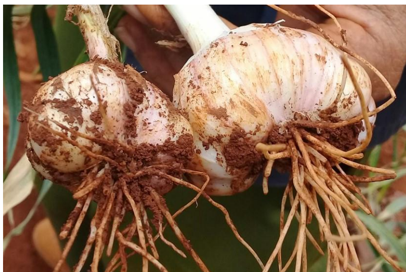
Figura 1. 'Fredy' new genotype of elephant garlic ( Allium ampeloprasum L.) introduced in Cuba