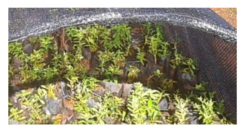
Figure 1. Rooted cuttings of Stevia rebaudiana Bertoni planted in the nursery of Ceballos Agroindustrial Enterprise

As vegetal material were used cuttings (sprouts with a length of approximately 8-10 cm), coming from mother plants of Stevia rebaudiana Bertoni propagated in vitro , with 120 days after sowing, kept in the Bioplant Center Adaptation Area from Ciego de Avila and free of pests (Figure 1). They were previously cultivated in polyethylene bags of 1.2 L capacity, containing as substrate a mixture of Ferrallitic Red Compacted Ferrallitic soil and filter cake (1:1 \text{ v/v})^{(15)} .