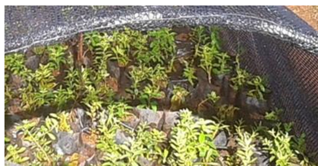
Figure 1. Rooted cuttings of Stevia rebaudiana Bertoni planted in the nursery of Ceballos Agroindustrial Enterprise.

As vegetal material were used cuttings (sprouts with a length of approximately 8-10 cm), coming from mother plants of Stevia rebaudiana Bertoni propagated in vitro , with 120 days after sowing, kept in the Bioplant Center Adaptation Area from Ciego de Avila and free of pests (Figure 1). They were previously cultivated in polyethylene bags of 1.2 L capacity, containing as substrate a mixture of Ferrallitic Red Compacted Ferrallitic soil and filter cake (1:1 v/v) (15).