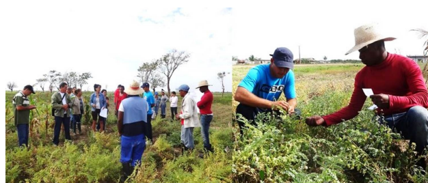
Figure 2. Various actors at the Agrodiversity Fair during the participatory selection of chickpea cultivars

The percentage of effective diversity was 75 % and most of the cultivars were selected by at least one of participants, which confirms good adaptation to the local edaphoclimatic conditions and great acceptance of the materials exhibited at the Los Palacios fair. It is suggested that the percentage of selection or effective diversity may be related to the variability of the species under study, since in a species with greater variability, local materials may be more important than in species with less variability (8).