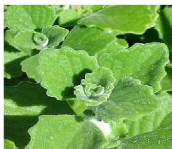
Figure 16. Plecthranthus amboinicus (Lour.)Spren, (Source: bitterrootrestoration.com)