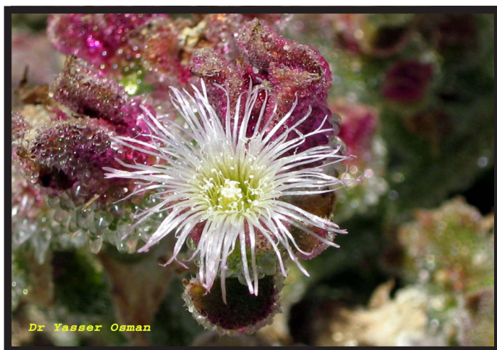
Figure 11. Ice plant ( Mesembryanthemum crystallinum )

The Cuban vascular flora embraces 6,700 species (500 Pteridophytes and 6,200 Phanerophytes of which about 20 are Gymnosperms and the rest Angiosperms), grouped in 1,300 genera and 181 families. A figure of 51 % endemism has been reported thus making about 3,100 endemic species. Moreover, Cuban natural ecosystems have been strongly altered during the last 200 years; about 16 % of its phanerogamic flora is threatened and probably 2 % is already extinct (22).