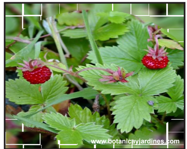
Figure 3. Fragaria vesca L.