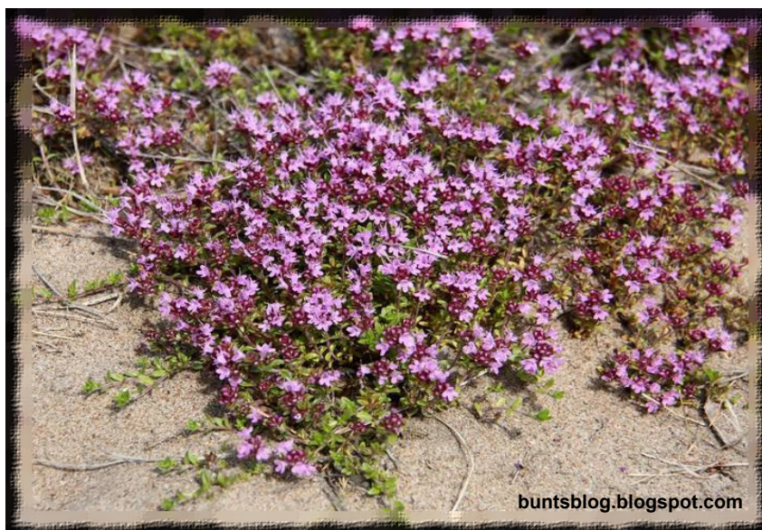
Figure 5. Thymus serpyllum L.