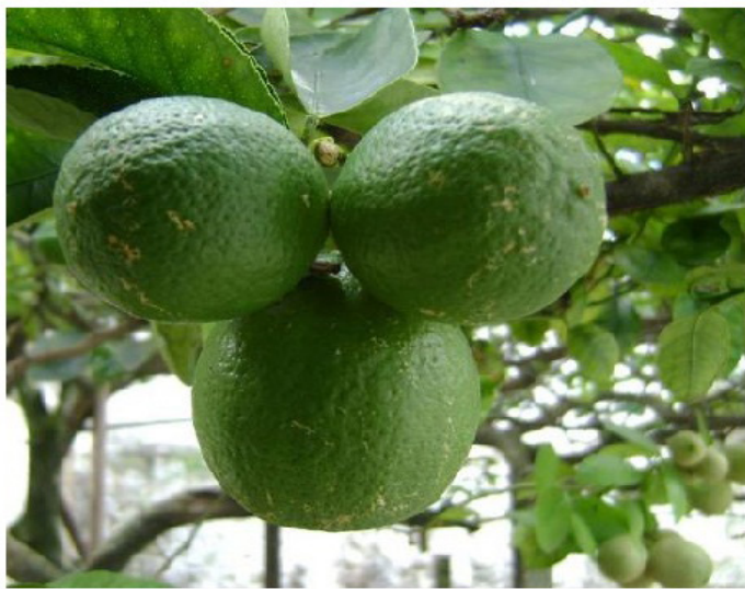
Figure 14. Citrus aurantifolia (Christm.)