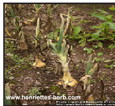
Figure 12. Allium cepa L.

Cuba has a great flora diversity typified by endemic dominance (51,4 %), floristic elements inversion, microphilia, and micrantia, and a high vulnerability. If together with all this join the existence of soils with a great edafic mosaic, excellent climatic conditions for the development of a lot exotic species, and a rich and complex cultural history that have contribute not only with a quantity of species, but also with a diverse use of them, so it is possible to conclude that Cuba has a great native and introduce vegetal wealth. This factors have been conditioned the existence of an economic flora not well study, that in the case of medicinal plants is particularly rich, in where since