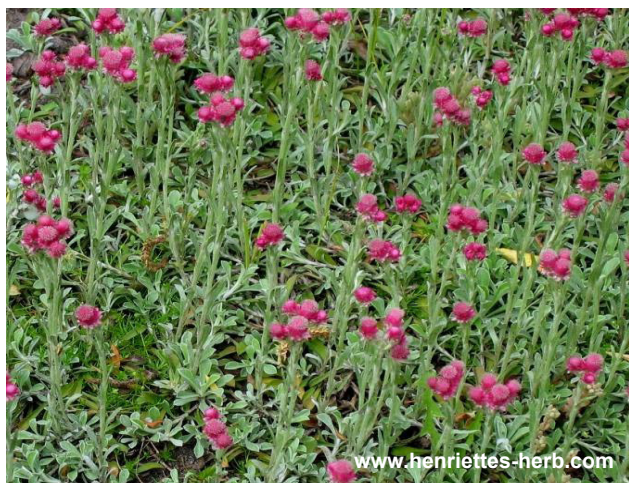
Figure 6. Antennaria dioica

Rosa majalis Herrm, Adonis vernalis L., Valeriana officinalis L. will require plantation cultivation to meet the needs of pharmaceutical base development. Saving and restoration of natural ecosystems is only possible when given a reasonable management based on scientific and legal bases. People should not forget the importance of genetic resources conservation not only for biological diversity and ecological balance, but also for their use in practical breeding (8).