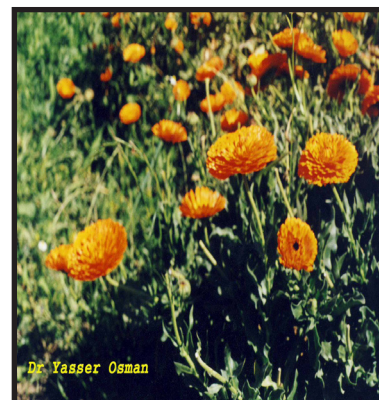
Figure 9. Calendula ( Calendula officinalis L.)