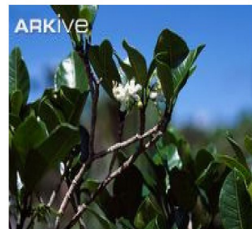
Figure 17. Tabernaemontana apoda C. Wright, (Source: arkive.org)

Cinnamodendron cubense Urb. (Figure 18): The genus is characterized for aromatic perennifolios trees. Species of this family can be use for hypotension control, cold, fiber and food condiment (25).