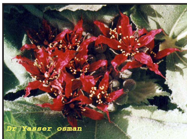
Figure 10. Moghat ( Glossostemon bruguieri )