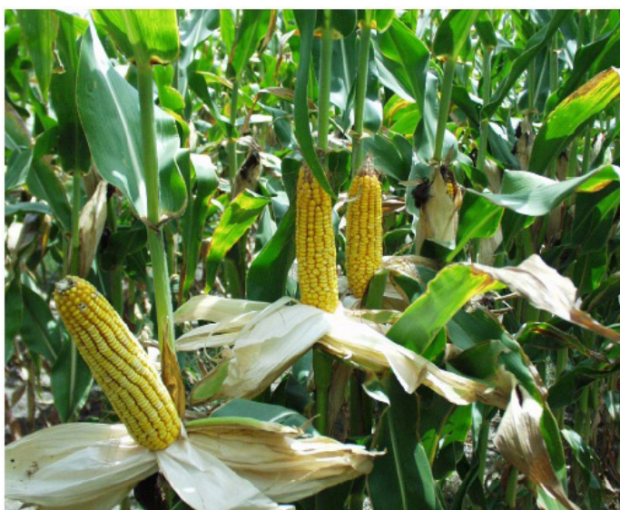
Figure 15. Zea mays L.

and toxicological evaluation of the species popularly referred as medicinal plants in Cuba (23).