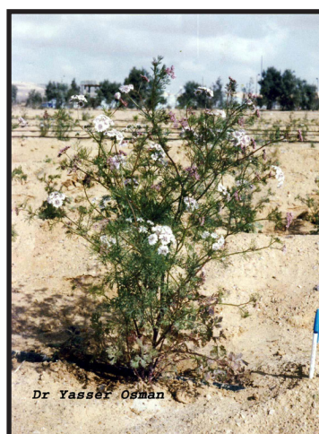
Figure 8. Coriander ( Coriandrum sativum L.)

Antifungal activities of Mesembryanthemum crystallinum (Aizoaceae) (Figure 11); Nicotiana glauca (Solanaceae), Moringa oleifera (Moringaceae), and some others were investigated against dangerous pathogenic and toxinogenic fungi ( Fusarium solani , Fusarium oxysporum , Aspergillus flavus , Alternaria alternate , Rhizoctnia solani , Alternaria solani , Pythium ultimum , Bipolaris oryzae , Rhizopus , Chetomium and Mucor . The overall results provide promising base line information