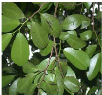
Figure 18. Cinnamodendron cubense Urb.

Juniperus lucayana Britton (Figure 19): From the leaves of this plants it is possible to extract oil with the composition of pinene (25–27 %), limonene (23–27 %), sabinene (11-12 %) with small amounts of sesquiterpenes, all this with medicinal properties (26).