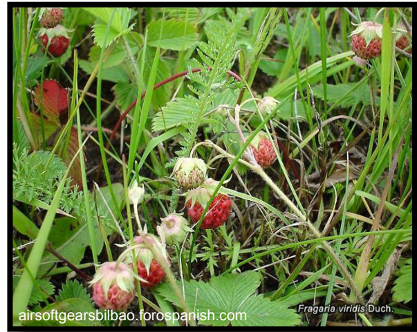
Figure 2. Fragaria viridis Duch.