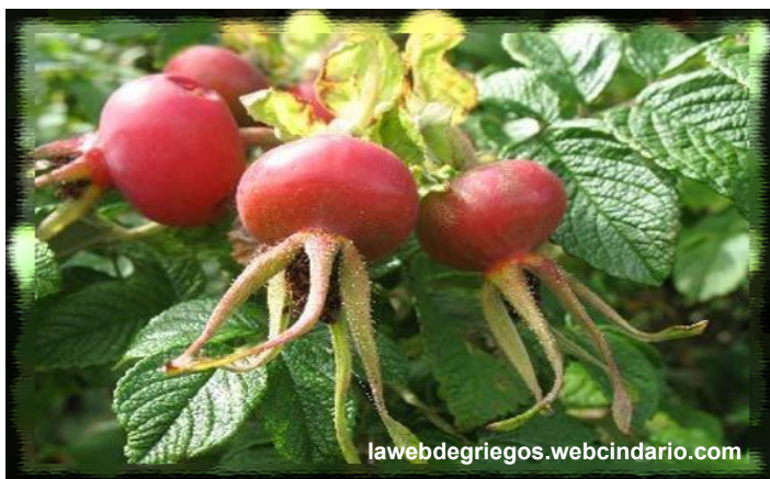
Figure 4. Rosa canina L.

Among the sorts of medicinal herbs found in the region there are those, the number of which are extremely small and they require protection. First of all, these are Adonis vernalis , Vaccinium vitisidaea L., Valeriana officinalis L., Oxycoccus palustris Pers., Nuphar lutea L. and others.