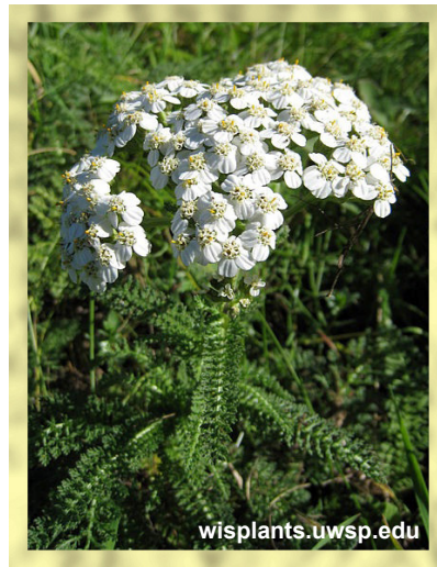
Figure 1. Achillea millefolium L.