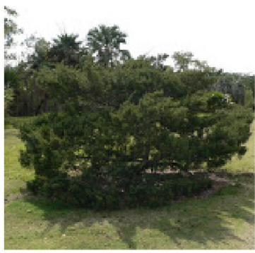
Figure 19. Juniperus lucayana Britton, (Source: forums.gardenweb.com)

Juniperus lucayana Britton (Figure 19): From the leaves of this plants it is possible to extract oil with the composition of pinene (25–27 %), limonene (23–27 %), sabinene (11-12 %) with small amounts of sesquiterpenes, all this with medicinal properties (26).