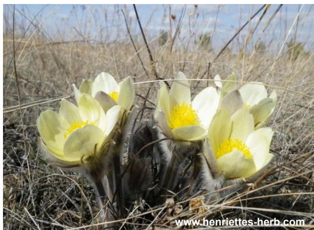
Figure 7. Pulsatilla flavescens Zucc.